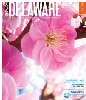
GOLD AWARD SHALOM DELAWARE SPECIAL EDITION