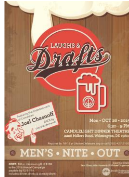
HONORABLE MENTION MEN'S NITE OUT INVITATION/FLYER