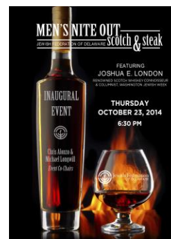
SPECIAL EVENT MEN'S NITE OUT "SCOTCH & STEAK"