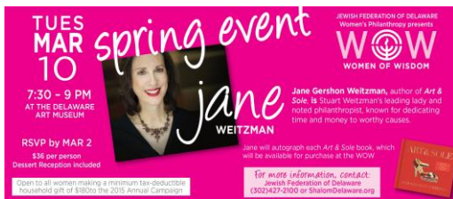
MEMBERSHIP WOMEN OF WISDOM "WOW"