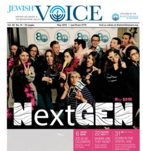
NEWSLETTER JEWISH VOICE

ASSOCIATION OF FUNDRAISING PROFESSIONALS (AFP) COMMUNICATION AWARDS RECOGNIZES AND HONORS NOT-FOR-PROFIT ORGANIZATIONS WHOSE COMMUNICATIONS DEMONSTRATE EXCELLENCE, QUALITY, CREATIVITY AND OVERALL EFFECTIVENESS