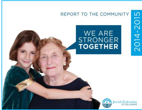
GOLD AWARD 2014-2015 REPORT TO THE COMMUNITY ANNUAL REPORT

INTERNATIONAL CREATIVE COMPETITION THAT RECOGNIZES OUTSTANDING ACHIEVEMENT BY MARKETING AND COMMUNICATIONS PROFESSIONALS