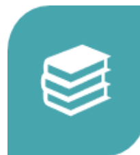
Education and Professional Training Services