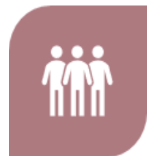
Services and Resources as a Result of Being Laid Off/Furloughed

RENEW your Annual Campaign Gift or MAKE A NEW GIFT of $100 or more by December 31 st , and your SUPPLEMENTAL gift up to $5,000 to the Human Services Relief Matching Fund will be matched by 50%!