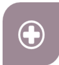
Trauma Support and Mental and Physical Health and Safety