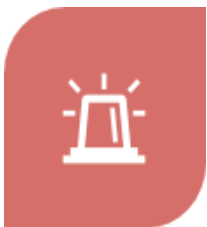
Emergency Financial Aid

All funds raised will be dispersed quickly to our local beneficiary agencies and programs that serve Jewish community members*.